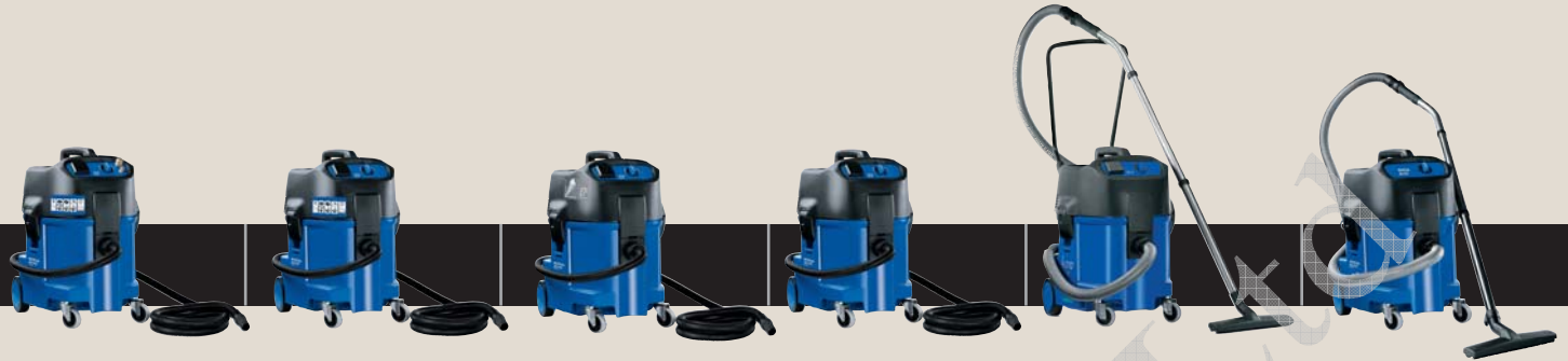
▲ ATTIX 560-31 XC